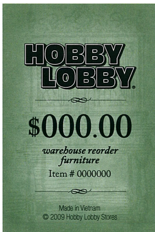
Warehouse Furniture Label

Please note that these tags and/or instructions may change at any time.